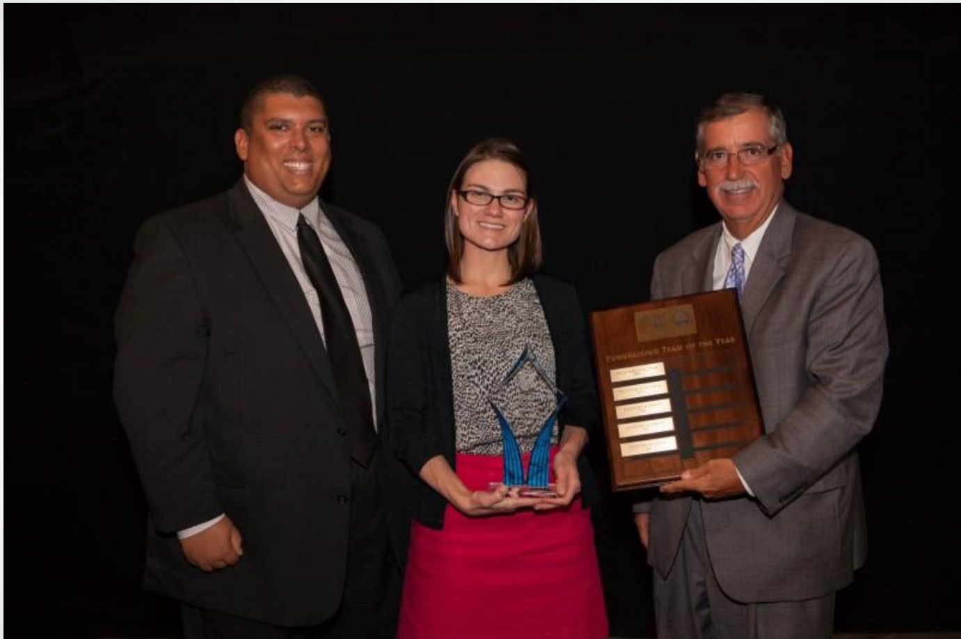
Facilities & Safety